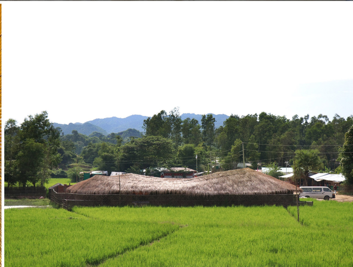
BEYOND SURVIVAL- A SAFE SPACE FOR ROHINGYA WOMEN & GIRLS Rizvi Hassan